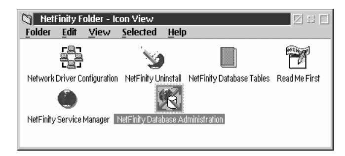
Figure 3. The Netfinity program group on an OS/2 Warp Version 4.0 system

The Netfinity Database Administration service is found in the Netfinity folder or Netfinity program group (see Figure 3). Open this icon to open the Netfinity Database Administration window.