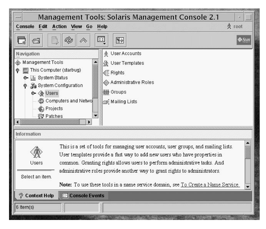
FIGURE 2-1 Solaris Management Console – Users Tool

The main part of the console consists of three panes: