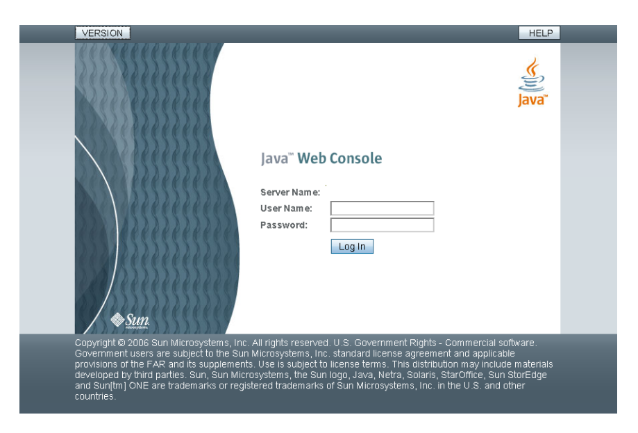
FIGURE 3-1 Java Web Console Login Page

After your user credentials are successfully authenticated, the launch page is displayed.