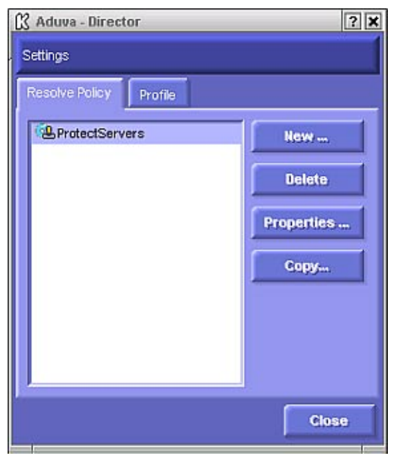
Figure 12 Settings window - Resolve Policy tab

The Settings window opens, displaying the Resolve Policy tab; see Figure 12.