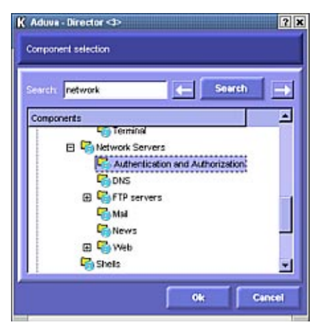
Figure 19 Component Selection window

The Component Selection window opens; see Figure 19. Select the type of inventory that you are interested in: hardware, kernel, software, private, or any subcategory of components.