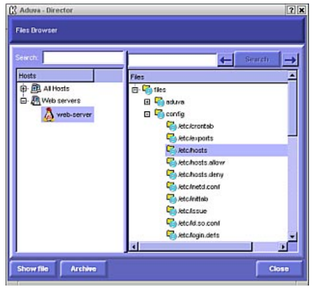
Figure 24 Files Browser window

The File Browser window opens; see Figure 24.