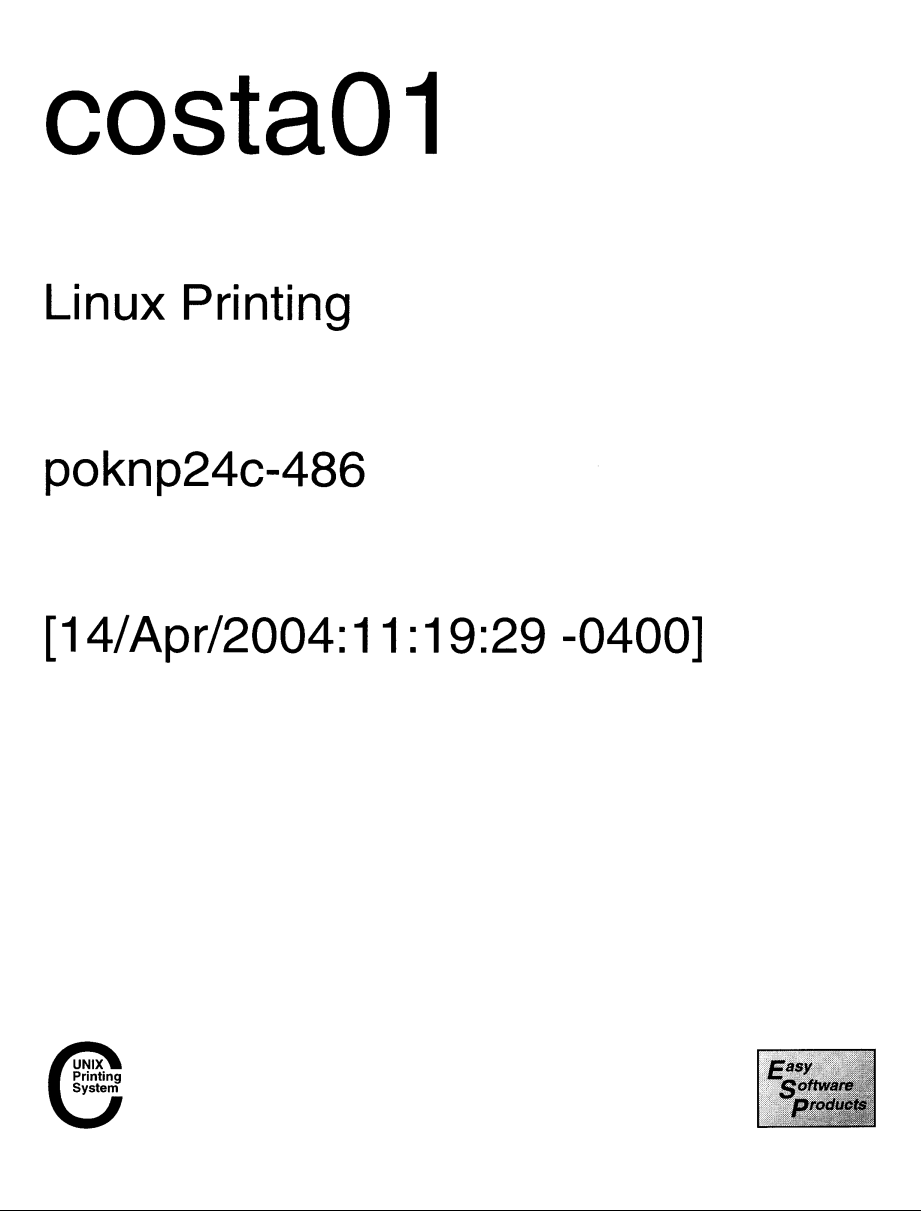
Figure 13 The itso banner page

Without knowing the details of Post Script and your printer's PPD file, it is difficult to modify other options within the banner for your specific type of printer.