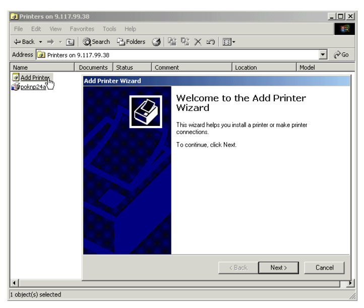
Figure 11 Adding a Samba/CUPS printer from a Windows desktop

You should now be ready to test printing from Windows through Samba and CUPS to the printer. First add the printer to the Windows desktop. From the Windows Explorer you opened, click Printers and then click Add Printer . This should bring up the Add Printer Wizard as shown in Figure 11.