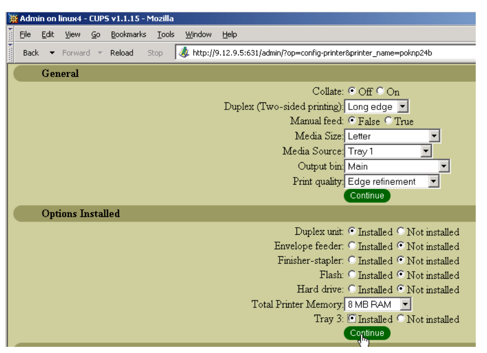
Figure 2 Setting Duplex via CUPS Web interface

Scrolling down further, you can make any other needed modification. After you are finished, click Continue to save your changes.