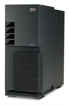
RS/6000 Model 170

"Designing with a green pen" signifies IBM's commitment to continuously improve the environmental quality of its RS/6000<sup>®</sup> products and processes.