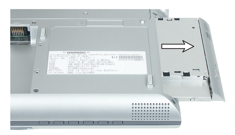
Tips & Tricks

8 Slide the old drive out of your notebook.