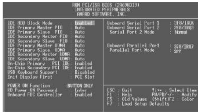
Figure-7 Integrated Peripherals Menu

The following indicates the options for each item and describes their meaning.