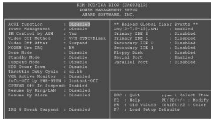
Figure-5 Power Management Setup Menu

The following indicates the options for each item and describes their meaning.