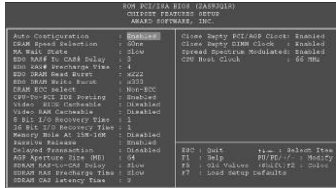
Figure-4 Chipset Features Setup Menu

The following indicates the options for each item and describes their meaning.