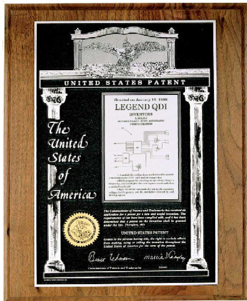
The Patent for SpeedEasy