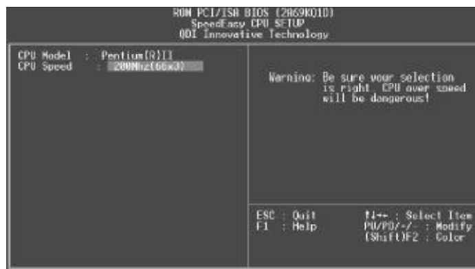
Abb. 1 SpeedEasy CPU Installationsmenü

Wählen Sie < SpeedEasy CPU SETUP> aus dem Hauptmenü und öffnen Sie das untergeordnete Menü