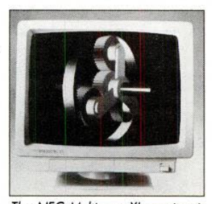
The NEC Multisync XL monitor is aimed at the CAD/CAM market, according to the company.

NEC also showed its new EGA-compatible Multisync