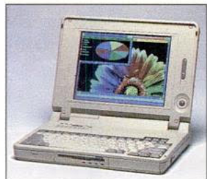
Compaq's Elite line incorporates Intel's 75-MHz DX4 and a 9.5-inch color screen.

The docking stations — which include a multimedia station, a "smart" expansion station with extra drive bays, and a low-end mindocking station — can be used both with the new Elite notebooks and the existing Lite notebook series.