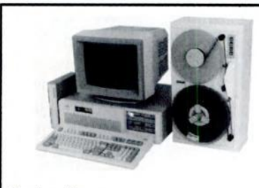
Simply exchange data files on a reel of 9-track tape.

tems bring full ANSI data interchange to IBM PCs or Macintosh, giving your micro the freedom to exchange data files with nearly any mainframe or minicomputer in the world. Available in both 7" and 10-1/2" versions, compact