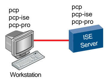
Figure 4-3 Real-Time and Remote PCP Installation

You may want to install the pcp, pcp-ise, and pcp-pro packages on a workstation in addition to the SGI Internet Server. Doing so will result in better display performance, especially if the workstation has hardware accelerated graphics. Figure 4-3 shows this deployment.