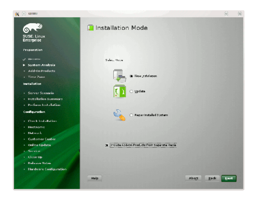
Figure 1 SLES11 Installation Mode Screen