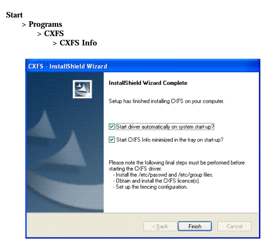
Figure 5-11 Start CXFS Driver

14. Choose to restart your computer later if you need to install passwd and group files or set up fencing; see "Postinstallation Steps for Windows" on page 146. Otherwise, choose to restart your computer now. The default is to restart later, as shown in Figure 5-12. (CXFS will not run until a restart has occurred.)