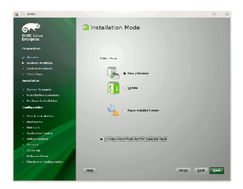
Figure 1 SLES11 Installation Mode Screen