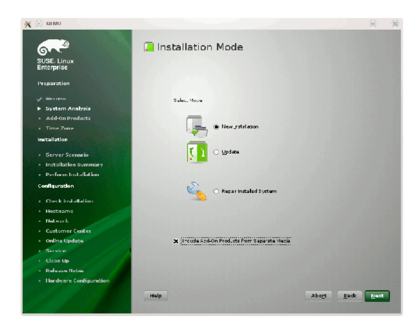
Figure 2-1 SLES11 Installation Mode Screen

3. From the Media Type screen, shown in Figure 2-2 on page 11, click the button to the left of CD .