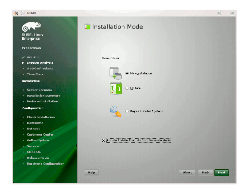
Figure 2-1 SLES11 Installation Mode Screen

3. From the Media Type screen, shown in Figure 2-2 on page 11, click the button to the left of CD .