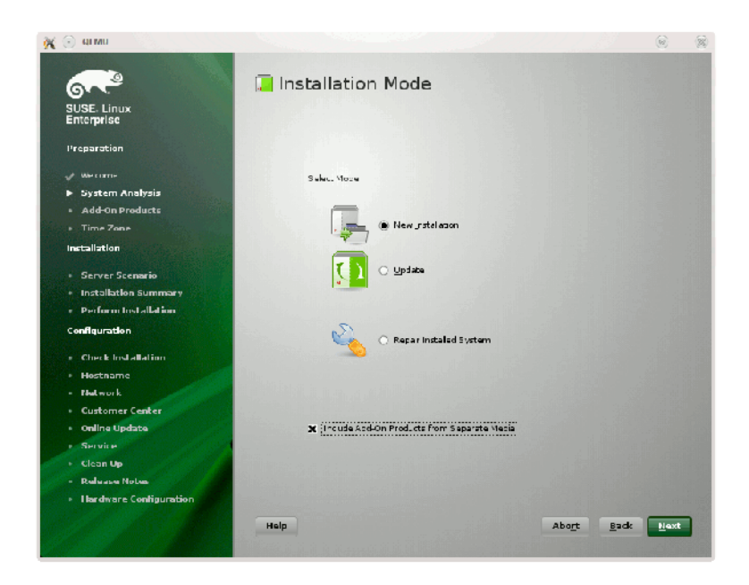
Figure 2-1 SLES11 Installation Mode Screen

3. From the Media Type screen, shown in Figure 2-2 on page 14, click the button to the left of CD .