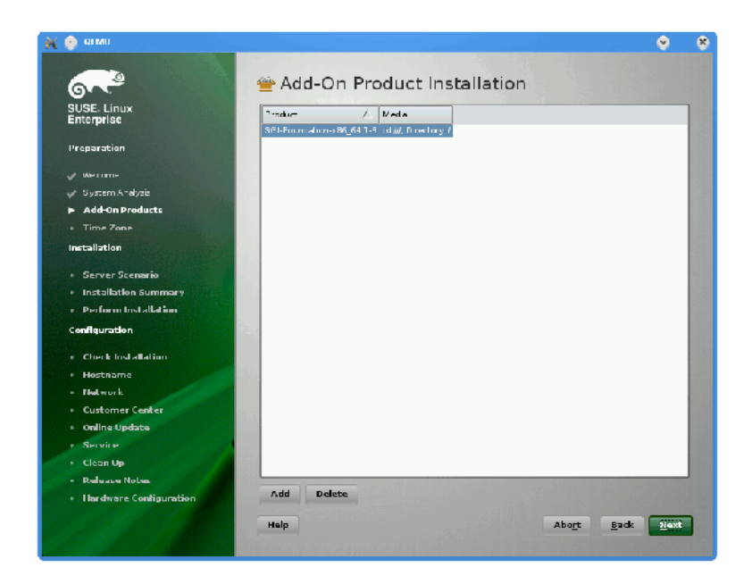
Figure 2-3 SLES11 SP1 Add-On Product Installation Screen Showing SGI Foundation